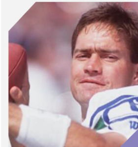
Jeff Kemp AUTHOR - Former NFL QB